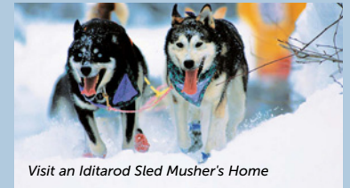
Visit an Iditarod Sled Musher's Home