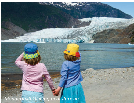
Mendenhall Glacier, near Juneau

For kids, our Alaska cruise is like a playground with the best rides. Take them dogsledding or rock-climbing*. Add SpongeBob SquarePants, and you've just made a great vacation awesome. For families, it's all about options, and our brand-new youth program is designed to keep everyone happy. Because Norwegians come in all sizes, we have kids' pools, game rooms and an exclusive Nickelodeon lineup that offers more choices than you can imagine. Plus, with accommodations that fit everyone to dining choices that satisfy even the pickiest eater, seeing Alaska The Norwegian Way means everyone gets a vacation. Even Mom and Dad.