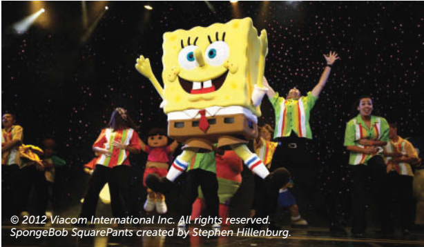
© 2012 Viacom International Inc. All rights reserved. SpongeBob SquarePants created by Stephen Hillenburg.