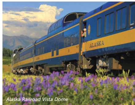
Alaska Railroad Vista Dome