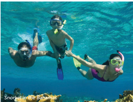
Snorkel in the Bahamas

It's hard to believe pirates once stomped along the Bahamas' pristine beaches. The vibe has gotten a bit more laid back since then, but it's your turn to enjoy it like you own the place. Swim in a blue lagoon with a bottlenose dolphin. Great Stirrup Cay, our private island in the Bahamas, is where you'll find the world's largest inflatable waterslide in the shape of a hippopotamus. Along the way, enjoy a whirlwind day visiting Orlando's theme parks. In the fall of 2013, our newest ship will be joining our island fleet. Norwegian Breakaway will sail to the Bahamas & Florida and the Caribbean from New York City and will feature The Waterfront, a wraparound quarter-mile oceanfront "boardwalk" of shops, restaurants and entertainment—at sea.