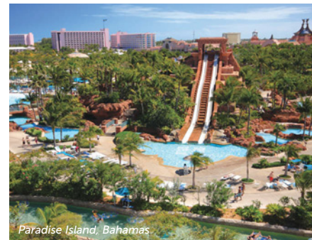
Paradise Island, Bahamas