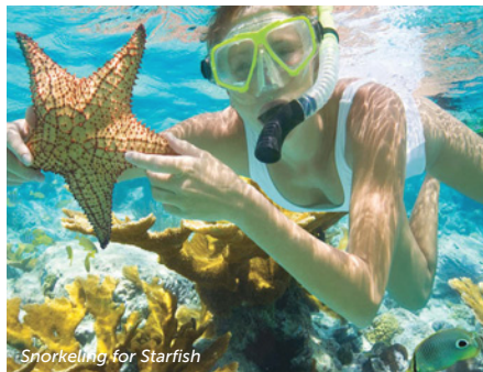
Snorkeling for Starfish