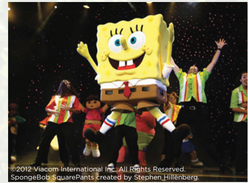
©2012 Viacom International Inc. All Rights Reserved. SpongeBob SquarePants created by Stephen Hillenberg.