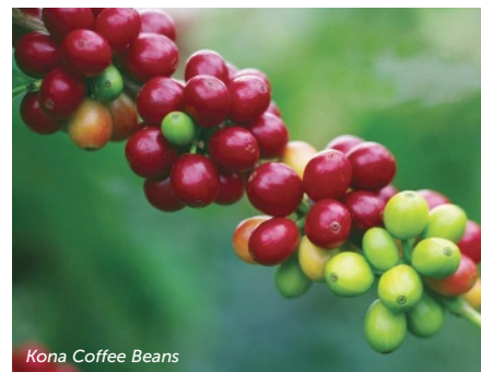
Kona Coffee Beans

2011 TOP 5 CRUISES, LARGE RESORT SHIPS READERS' CHOICE PLATINUM LIST