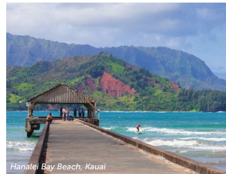
Hanalei Bay Beach, Kauai