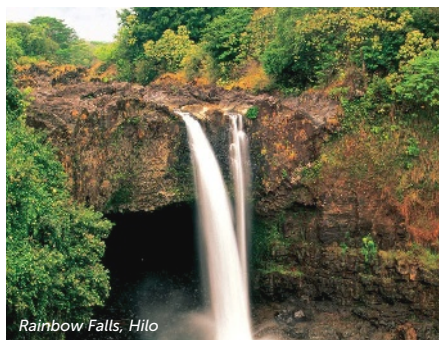
Rainbow Falls, Hilo