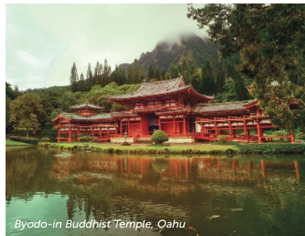
Byodo-in Buddhist Temple, Oahu