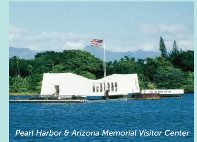
Pearl Harbor & Arizona Memorial Visitor Center