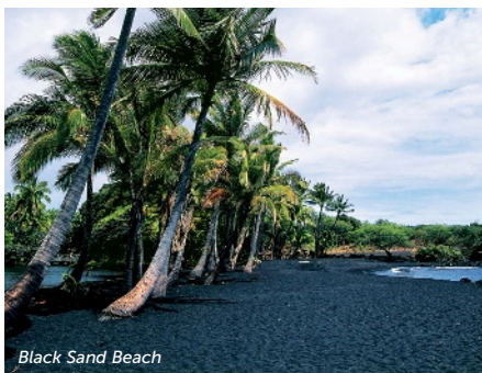
Black Sand Beach

As the largest island in the archipelago, Hawai'i Island is called the "Big Island" for good reason. On the northeast coast, the lush rainforests and magnificent waterfalls of Hilo will take your breath away. More impressive and rising over 4,000 feet, Kilauea is one of the most active volcanoes on earth. Take a helicopter tour and watch as the blistering lava flows into the sea. Hike through an extinct lava tube or walk barefoot along the black-sand beaches of Kaimo. The western sun-drenched coast of Kona is where you'll discover beautiful Kealahou Bay. Its rugged lava-lined shoreline first welcomed Captain James Cook in 1778, the first westerner to visit the island. Puuhonua o Honaunau is where the spirits awaken on your way to the sacred temple of Hale o Keawe Heiau. Whatever you do, the memories you take away will be as grand as the island itself.