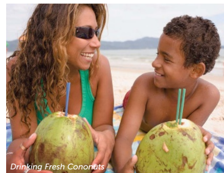
Drinking Fresh Coconuts

Get a full listing of family activities at ncl.com/family or call your travel professional or 1.888.NCL.CRUISE